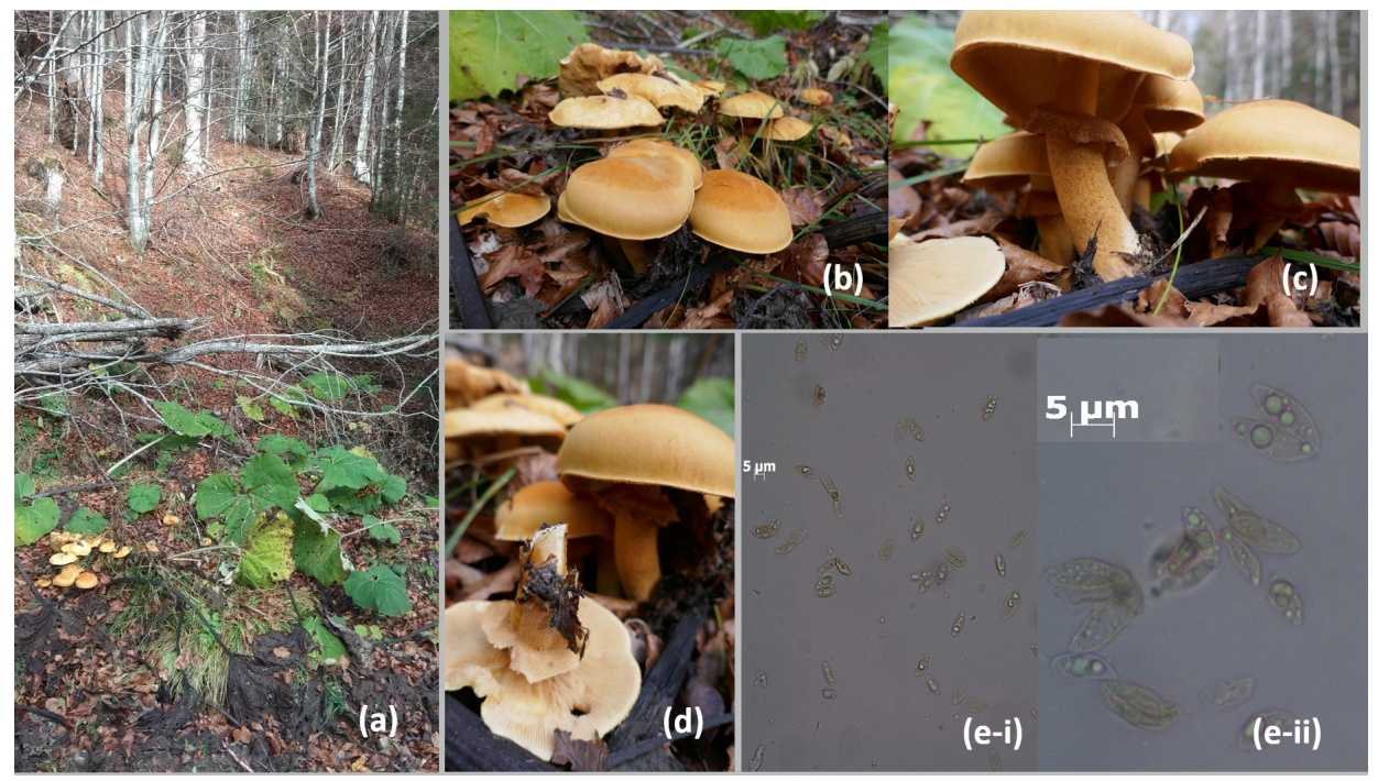
Fig. 1. Phaeolepiota aurea, a-d basidiomata in situ, e-i, e-ii spores.

sequencer (PE Applied Biosystems). Sequences were manually curated for sequencing ambiguities. The generated nrLSU sequence of the P. aurea specimen was deposited in GenBank with the accession number MW147712.