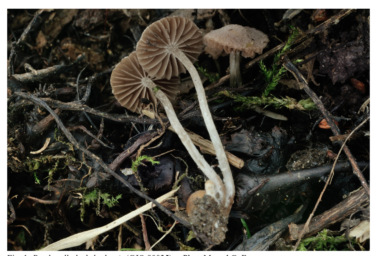
Fig. 1. Psathyrella lyckebodensis (GJO 90035).

The specimen is deposited in GJO (Universalmuseum Joanneum in Graz).